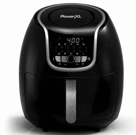
7 Qt. - HF-1096LCD