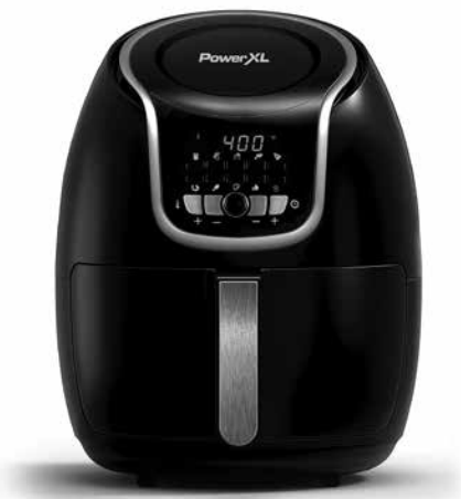
5 Qt. - HF-8096LCD